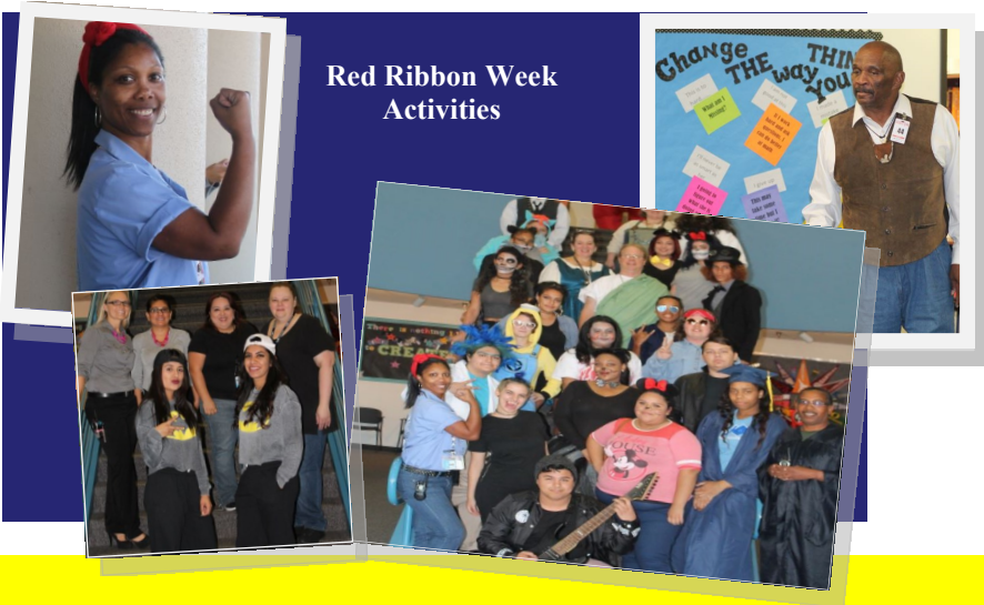
Red Ribbon Week Activities